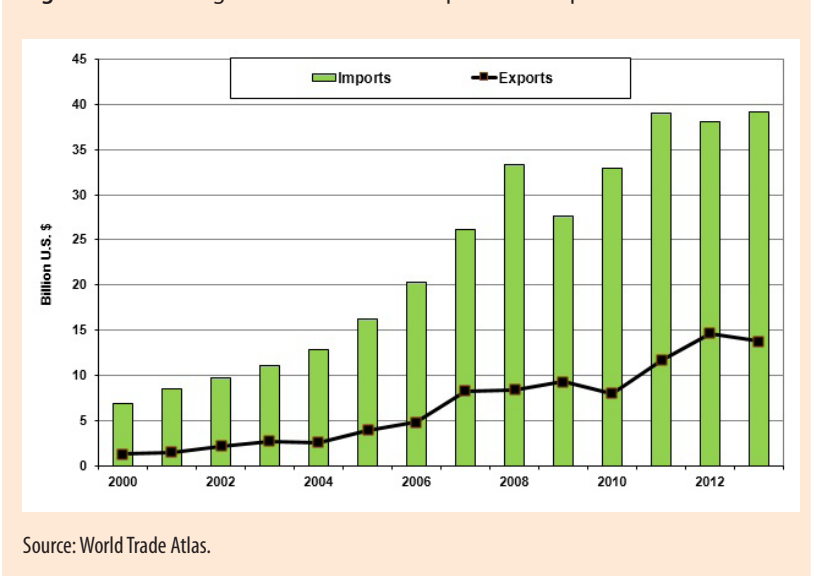
Figure 2: Russian Agricultural and Food Imports and Exports

Despite Russia's large grain exports, the country is a much larger agricultural importer than exporter (figure 2). In 2013, Russia's agricultural and food imports totaled $39 billion, versus exports of $14 billion. Russia has such a large negative trade balance